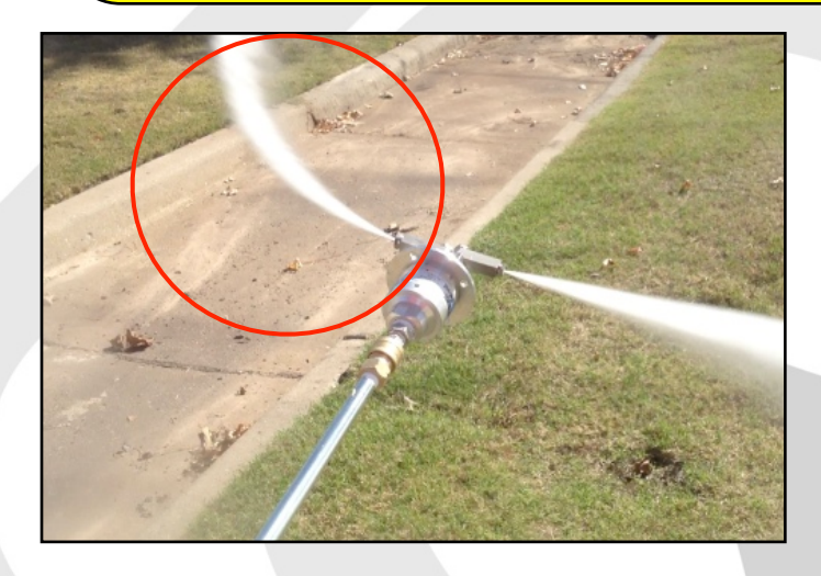
DRIPLOC HEAD RUNNING @300-500 R.P.M. SPRAY REACH

NOTICE LOWER R.P.M. SPRAY PATTERN ON THE LEFT REACHES OUT FURTHER THAN HIGH R.P.M. SPRAY PATTERN ON THE RIGHT