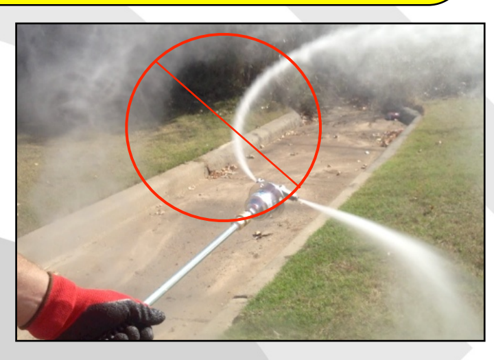
COMPETITORS HEAD RUNNING 3000 R.P.M. SPRAY REACH APPROX. 12" FROM SPRAY TIP

SEE DEMO VIDEO AT <u>WWW.DRIPLOC.COM</u> SELECT "STINGER DUCT CLEANER" IN MENU