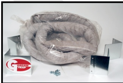
BRACKET STYLE KIT